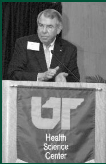
CHANCELLOR RICE BEGINS THE DEDICATION CEREMONY

“Dedication Ceremony...” continued from previous page