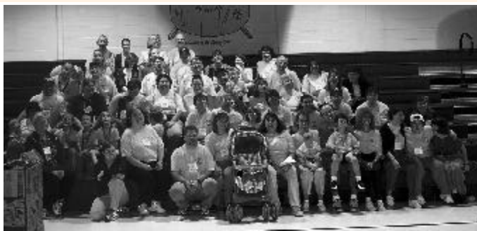
Attendees of the USA Aniridia Network meeting

UT Health Science Center Department of Ophthalmology 956 Court Avenue, Suite 228 Memphis, Tennessee 38163 (901) 448-5492 Fax (901) 448-1299 ADDRESS CORRECTION REQUESTED