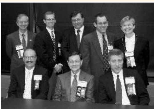
The faculty of "Thyroid Eye Disease: Management from A to Z"